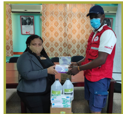
Representative of the Dominica Council of Aging receives donation