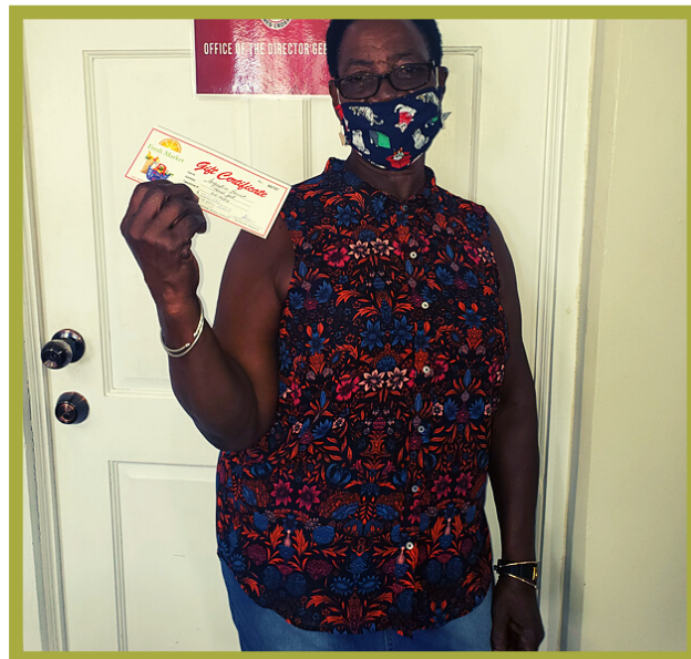
Recipient grateful for receiving a food voucher

This initiative aims at assisting persons whose livelihood was impacted by the pandemic. Some vouchers were also issued to vulnerable individuals within various communities. The food voucher was valued at XCD$150.00.