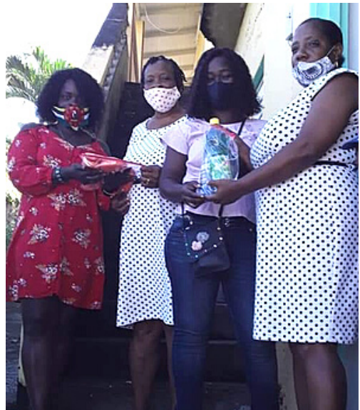
Wesley Branch members hand over donation of care package to school

Our second act targeted an individual who had an unfortunate health incident and had one of his legs amputated. While waiting for a prosthetic leg, he utilized crutches to get around. The group decided to provide him with a new pair as the one he had was a bit worn down.