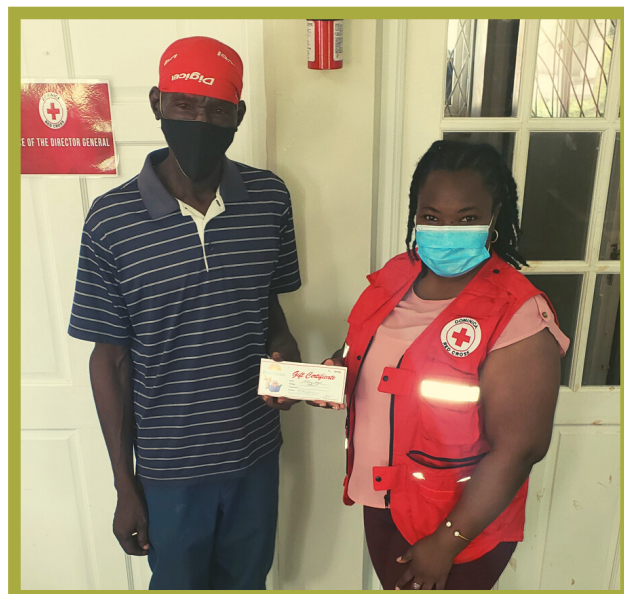
Food voucher recipient