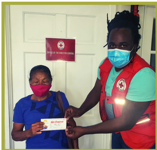
Food voucher recipient