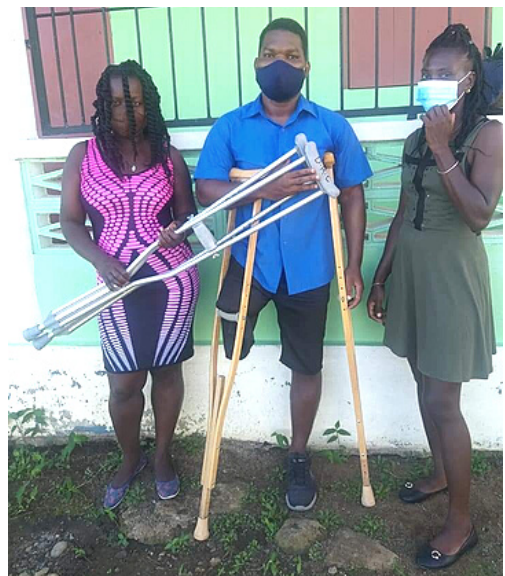
Wesley Branch members assists vulnerable man in the community

This new pair of crutches was provided by the Dominica Red Cross Headquarters and was presented to the individual by the President and one supporting member.